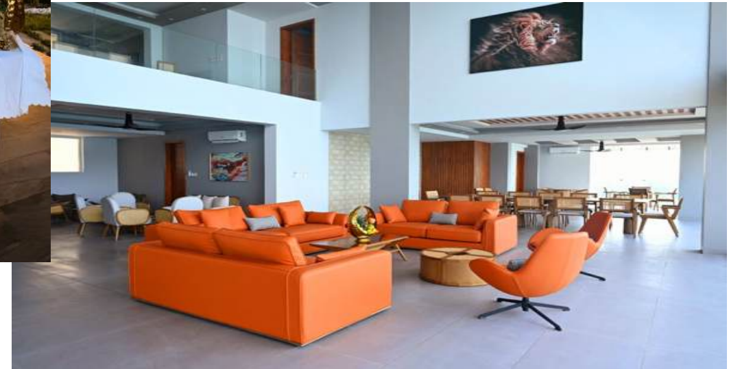
Four-Bedroom Luxury Penthouse