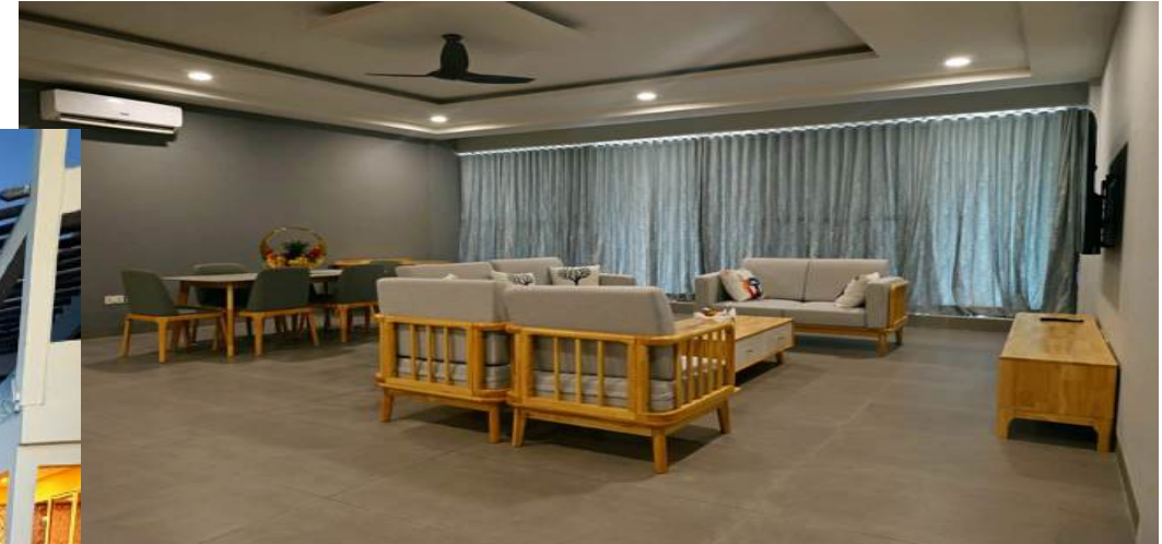
Three-Bedroom Sea View Suites