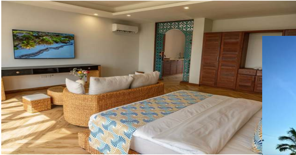
Premium Room Sea View & Partial Sea View