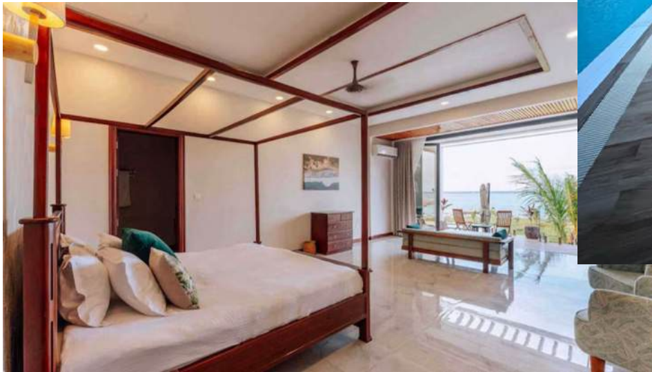
Three-Bedroom Luxury Royal Villa